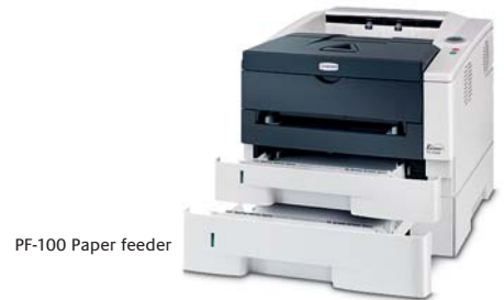
PF-100 Paper feeder

Product depicted includes optional extras