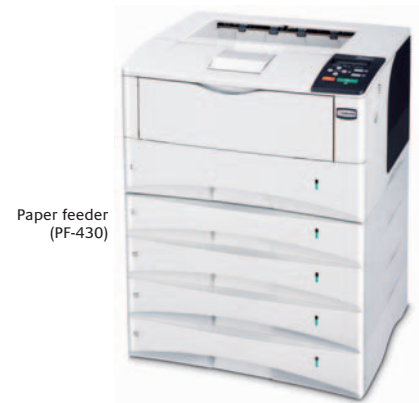
Paper feeder (PF-430)

Product depicted includes optional extras